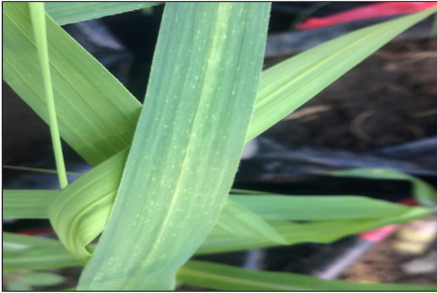
Figure 2. Appearance of resistant sugarcane leaf for downy mildew ( Peronosclerospora philippinensis ) after 3 months (VMC-87599).