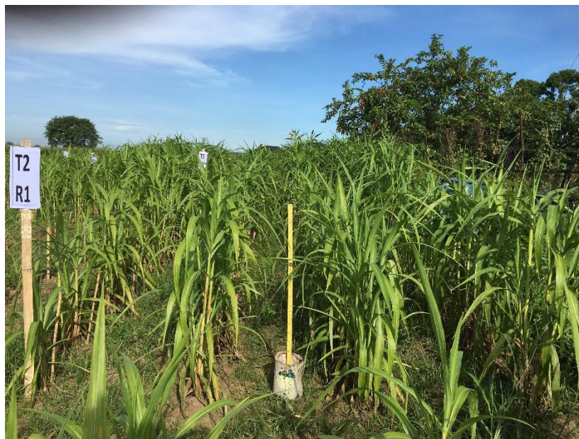
Figure 1. Experimental area of ratooned adlay.

season. Off-barring was performed four weeks after ratooning using animal-drawn implement to minimize weed growth. Hilling-up was subsequently done to control subsequent weed growth and to pile soil around the roots at 75 days after ratooning (DAR). Hand weeding was conducted regularly to prevent competition for sunlight, nutrients, water, and space between weeds and the adlay plants. Plants were irrigated daily during the early growth particularly when soil moisture was insufficient.